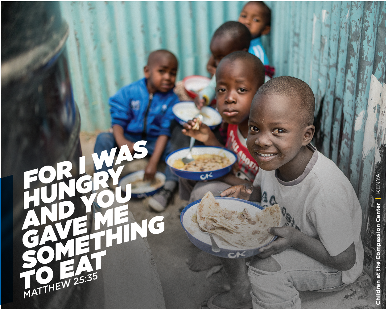
Children at the Compassion Center | KENYA

Most Compassion Sunday events are led by a current Compassion sponsor. It's likely that the very reason you're reading this guide is that a member of your church who's passionate about child sponsorship gave it to you. Or maybe that person is you. Either way,